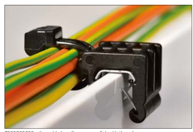
T50ROSEC23 - the cable bundle runs parallel with the edge.